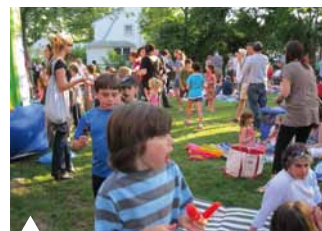
The family barbecue celebrates year end at Lesley Ellis.