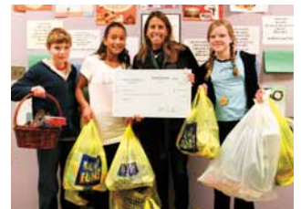
During an all-school assembly, students present their donation to a local organization that provides birthday parties for homeless children.

Lessons about acceptance and caring permeate every Lesley Ellis community interaction. Responding to wider community needs, students discover the importance of helping others and develop the foundation for a lifetime of responsible global citizenship.