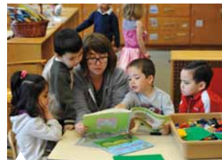
A preschool teacher reads a story about construction at the building table.

The low student/teacher ratio ensures an exceptional level of attention to student needs and a focus on personal guidance and support. Teachers at all levels keep parents informed of classroom activities through conferences, detailed progress reports, and weekly newsletters, and work closely with families to appropriately tailor the curriculum for each child.