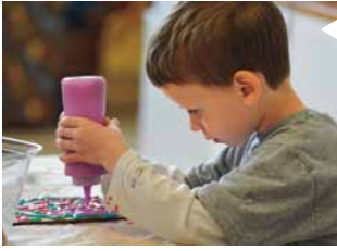
A prekindergartner explores famous artists' painting techniques.