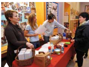
Parents strengthen the Lesley Ellis community as they share their time and talents.

In the hallways before and after school, at monthly assemblies, and during regular Community Conversations, parents gather to speak with faculty, staff, and fellow parents. Throughout the year, Lesley Ellis parents and families come together for Friday night playdates, performances, the fall meeting, spring auction, and the end-of-year family barbecue.