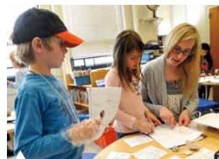
First and second grade partners work with their teacher to classify rocks and minerals.