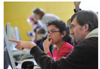
A teacher helps his third grade student learn to program her LEGO vehicle to move across the room.