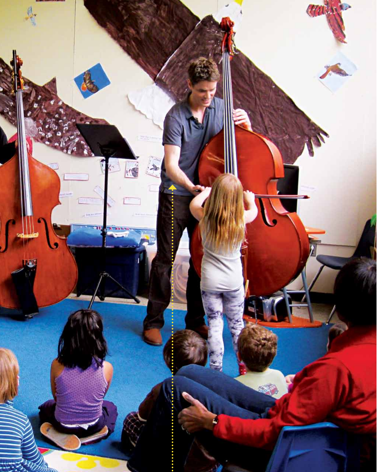
● The father of a transitional kindergarten student visits the classroom to play the upright bass, giving each child a turn with the bow.