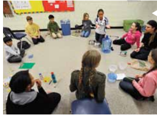
Fifth and sixth graders take turns conducting a band of classmates playing homemade instruments in preparation for Spring Visiting Day.