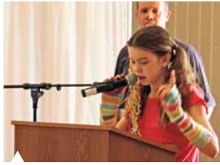
An upper elementary student introduces the next class performance at an all-school assembly.

“I’m thrilled that my son can ski, swim, and study karate through the Afterschool Program. There are so many great extra-curricular offerings—both he and I wish there were time to do more. One day he asked, ‘Can I go to Afterschool every day? It’s so much fun there!’”