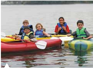
Students in the Afterschool Program kayak on Spy Pond.