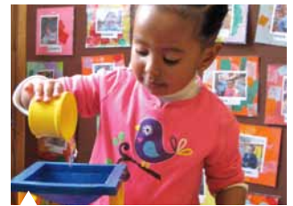
A preschool child is given ample time to explore and experiment as she discovers the properties of water.

● The warm bond between teachers and students allows children to take academic risks and confidently share their ideas.