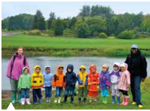
Regular field trips allow children to connect their classroom learning with the greater world. Transitional kindergartners visit a 300-year-old farm as part of their curriculum unit on pioneers.