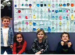
Students tally the number of coats collected for a local drive by creating a graph using paper cutouts of coats.